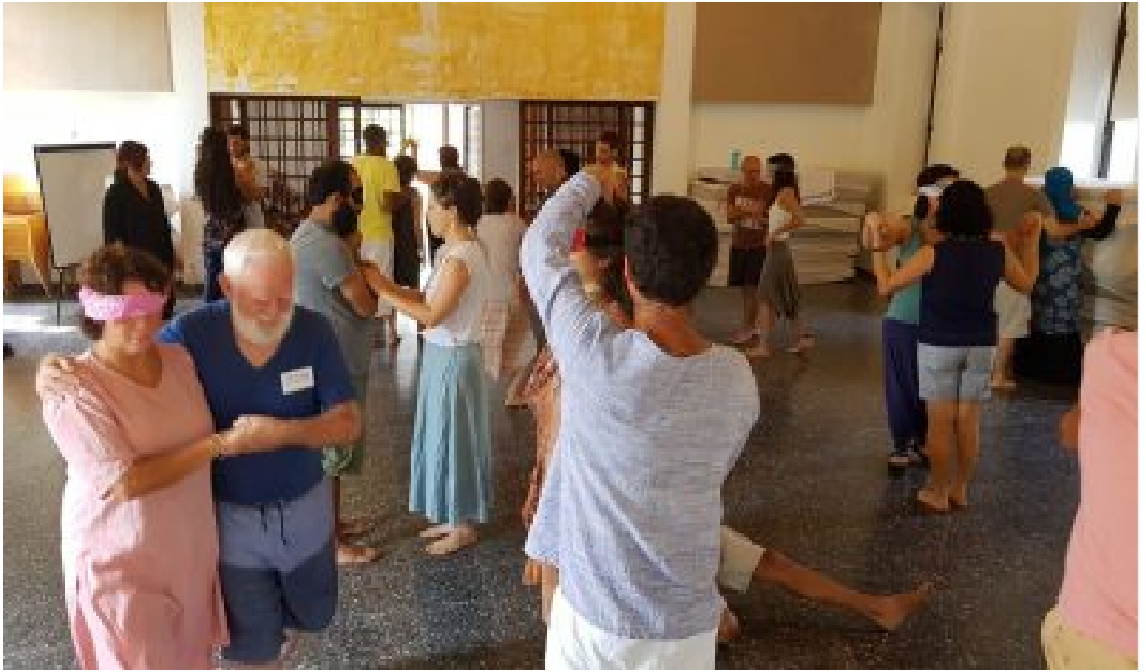
Together Beyond Words