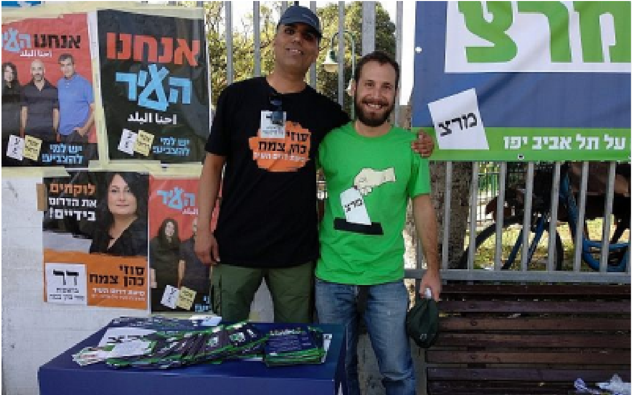
Meretz in Israel's 2018 Municipal Elections