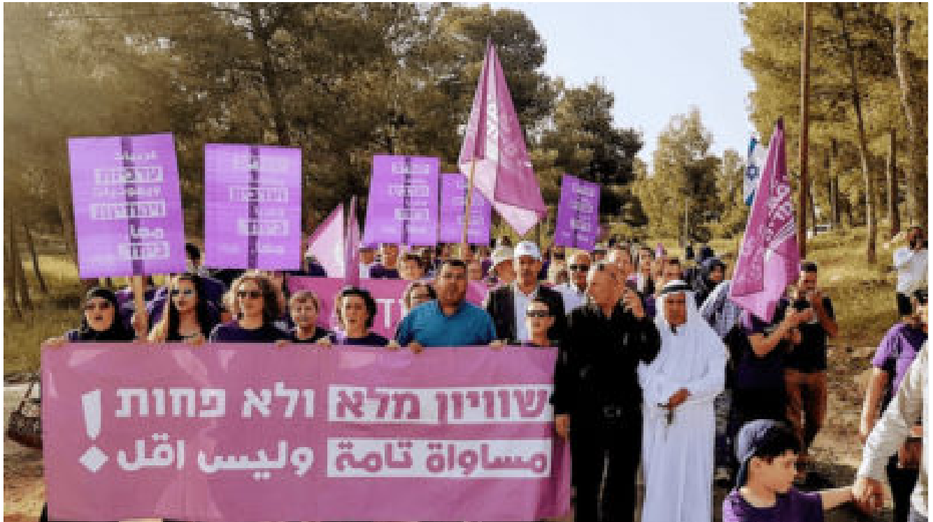
Standing Together (Omdim B'Yachad) Against Injustice