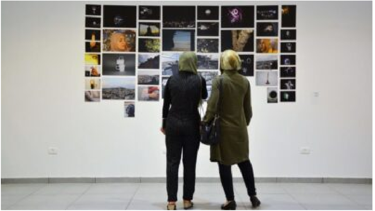
The Umm el-Fahem Art Gallery